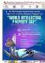
World Intellectual Property Day1.jpg 371K

This email is governed by the Disclaimer Terms of SIU, which may be viewed at http://siu.edu.in/infoclearn.php